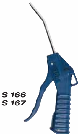
S 166 S 167

Small, lightweight design is convenient to use anywhere. Blo-gun has built in hang-up hole.